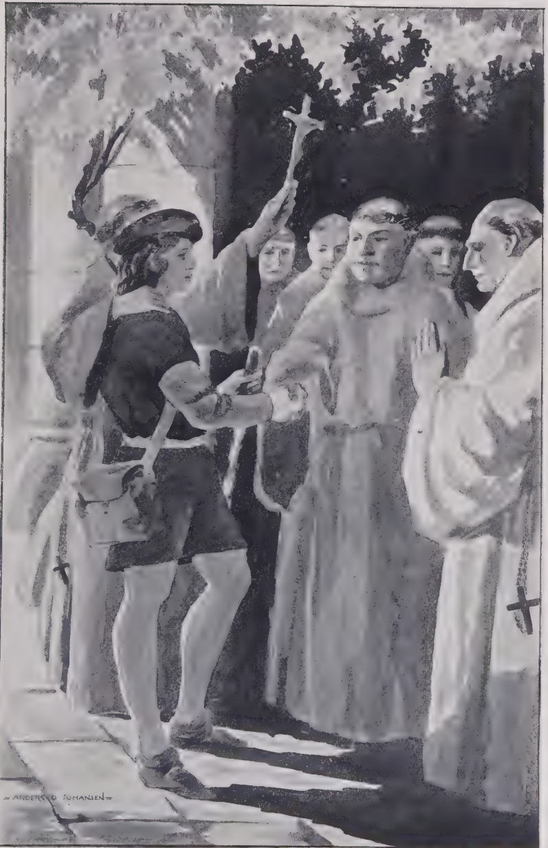
UNDERNEATH, IN THE PORCH OF THE ABBEY, THE MONKS HAD GATHERED TO GIVE HIM A LAST GOD-SPEED.